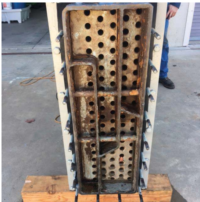
After photo of heat exchangers, with scaling noticeably reduced.

all routine, semi-annual and annual maintenance for the HOD UV systems at Parker Dam. Atlantium's level of familiarity with the technology allowed them to provide routine service far quicker than what Parker Dam staff could have performed. This resulted in better utilization of Parker Dam staff by directing their efforts to projects where they were the most effective in terms of time and associated costs.