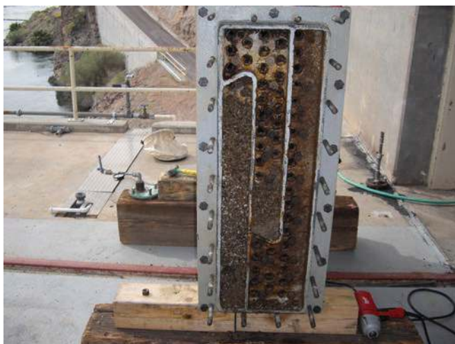
Before photo of Parker Dam heat exchangers, with significant scaling

Reclamation personnel entered into a turnkey annual maintenance agreement with Atlantium to perform