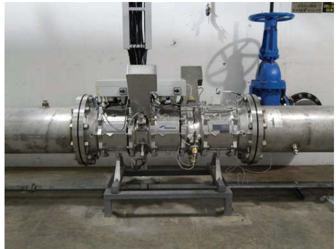
The Hydro-Optic UV system installed at Parker Dam.

In December 2015, two HOD UV systems were installed at Parker Dam. Each UV system (Model RZB300-12 with DPM or deposit protection mechanism) accommodates a flow rate of 454 cubic meters per hour (1,600 gpm) for water quality conditions with UV transmittance (UVT) as low as 85%. UVT is an indicator of water quality and designates the percentage of UV light that passes through the water. The remaining three HOD UV systems were installed and commissioned in the spring of 2016.