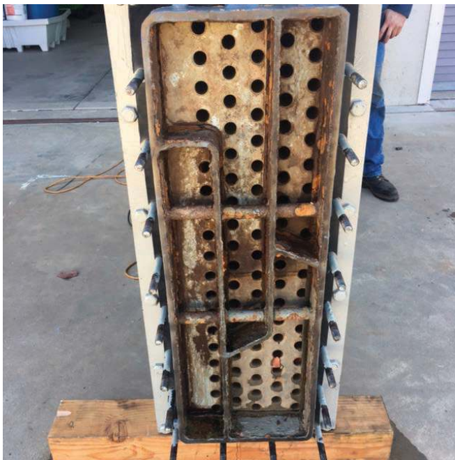
After photo of heat exchangers, with scaling noticeably reduced.

all routine, semi-annual and annual maintenance for the HOD UV systems at Parker Dam. Atlantium's level of familiarity with the technology allowed them to provide routine service far quicker than what Parker Dam staff could have performed. This resulted in better utilization of Parker Dam staff by directing their efforts to projects where they were the most effective in terms of time and associated costs.