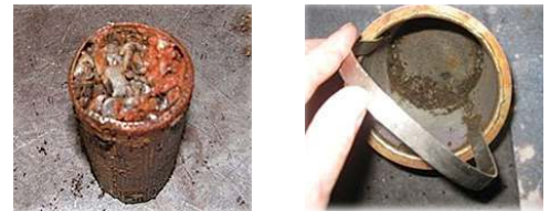
Figure 1: Davis Dam cooling water in-line strainer before and after Hydro-Optic™ UV (right) in 2013

Davis Dam is a hydroelectric facility with a nameplate capacity of approximately 250 megawatts that is managed by the Bureau of Reclamation (Reclamation) Lower Colorado Dam Office. Following the spread of quagga mussels to Lake Mead, Reclamation began a feasibility study in 2007 to identify control options that could protect their facilities (Hoover, Davis, and Parker Dams) while having little to no environmental or ecological impact. This location was chosen as the research facility to evaluate the Hydro-Optic™ (HOD) UV treatment system versus traditional medium pressure UV. Following the evaluation of various chemical and non-chemical control methodologies, the Hydro-Optic™ (HOD) UV treatment system was selected as the preferred treatment to supplement operational and mechanical activities already in place at Davis Dam.